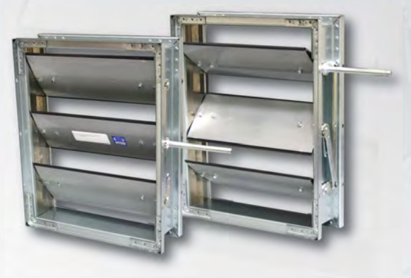
Models 2010 & 2020