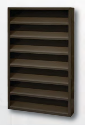
Models 1704J and 1706J