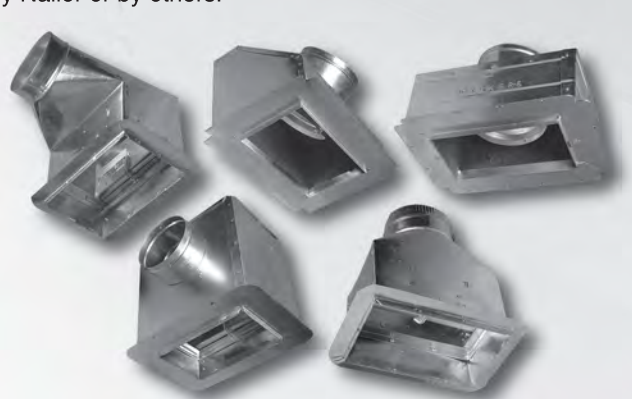
Models 0758, 0759, 0760, 0761, 0762 (L to R)

Models 0755, 0756(D) and 0757(D) Ceiling Radiation Dampers have been designed and tested for simple installation in specific UL design wood truss ceiling assemblies. They are UL Classified for use in 1 hour rated UL floor/ceiling design numbers L550/L562/L574/L579/L585/M503 and roof/ceiling design numbers P531/P538/P545/P547/P552. Model 0755 ships complete with thermal blanket and top inlet round duct connection. Model Series 0756 features a factory sheet metal plenum for steel grille/diffuser mount or ducted applications with duct collar(s), Model 0756D. Model 0757 is designed for steel grille/diffuser mount applications or ducted applications, Model 0757D, with field installed steel or fiberglass plenums (by others). Model 0763 is designed to mount inside a field supplied internally insulated steel plenum (by others) that accommodates a steel grille, register or diffuser, by Nailor or by others.