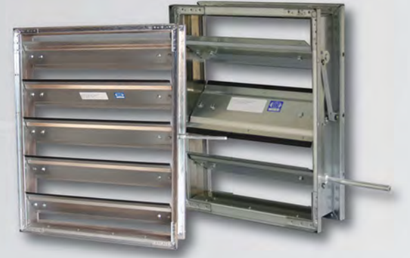
Models 1110 & 1120

Model 1110 and 1120 High Performance Control Dampers are Nailor's most economical airfoil blade control damper, suitable for use in low to medium pressure and velocity commercial HVAC systems. Design features include a steel airfoil blade for low pressure drop and reduced noise, sturdy galvanized steel hat channel frame with die-formed corner gussets for reinforcement and structural strength equivalent to 13 ga. (2.4) channel type frames and no-maintenance concealed linkage out of the air stream for reduced pressure drop and air turbulence. A variety of electric or pneumatic actuators are available for factory or field mounting. Models 1110 and 1120 Control Dampers are AMCA licensed for Air Leakage and Air Performance.