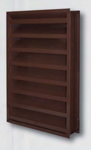
Models 1704DHP and 1706DHP