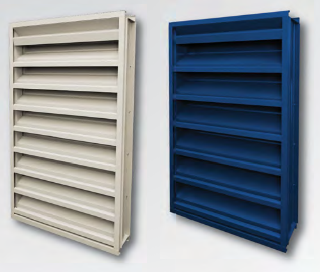
Models 1604DD & 1606DD

Nailor Models 1604DD and 1606DD combine exceptional weather protection during the most enduring rain conditions, great air performance through a large free area and pleasing aesthetics that enhance any structure's exterior design. Complemented by a drainable head, the dual drainable blade design utilizes double rain gutters that divert collected water down concealed side downspouts and out through the sill preventing water from infiltrating the space. Blades are reinforced with full length integral bosses for superior strength. Suitable for use in exhaust and medium to high velocity intake applications where water penetration concerns are a major priority. Available in channel, flanged, or glazing adapter type, the 4" (102) or 6" (152) deep frame installs easily in most common wall configurations. Nailor Models 1604DD and 1606DD are AMCA Licensed for Water Penetration and Air Performance.