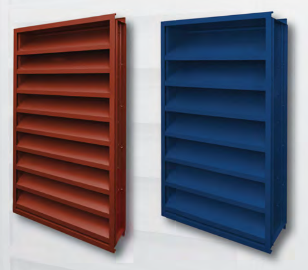
Models 1604J & 1606J

Nailor Models 1602J, 1604J and 1606J are architecturally styled louvers utilizing J style blades, crafted with a clean continuous architectural appearance that will visually compliment any structure's exterior. The blade design provides protection against general weather conditions, with low pressure drop characteristics and a high free area. Reinforcing bosses run the full length of each blade for superior strength. Suitable for use in ventilation, exhaust and low to medium velocity intake applications, well suited for use in specialty shape architectural applications. Available in channel, flanged, or glazing adapter type, the 2" (51), 4" (102) or 6" (152) deep frame installs easily in most common wall configurations. Nailor's architectural louvers are engineered to be aesthetically appealing as well as mechanically enduring.