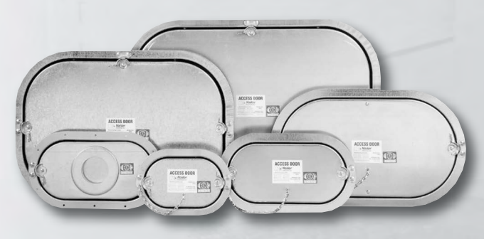
Model Series 0800