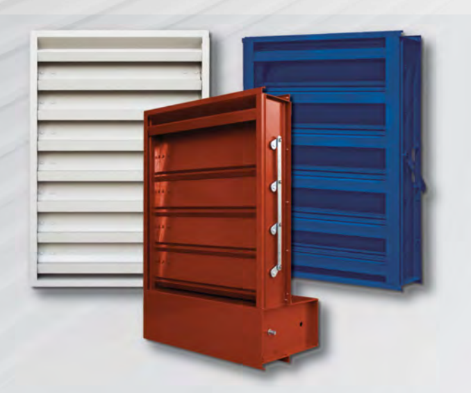
Models 1604AD, 1606AD (w/ Concealed Actuator) & 1606CDAF

Nailor Models 1604AD and 1606AD Adjustable Drainable Blade Louvers combine superior weather protection and pleasing aesthetics with airflow control. Nailor Model 1606CDAF is a combination louver and damper that incorporates front stationary drainable blades and rear adjustable airfoil blades, all within a single frame. Low torque, concealed linkage blade control can be operated manually or with an actuator to provide tight shut-off when desired. Suitable for use in exhaust and low to medium velocity intake applications. Available in channel or flanged type, the 4" (102) or 6" (152) deep frame installs easily in most common wall configurations. Nailor Models 1604AD, 1606AD and 1606CDAF are AMCA Licensed for Water Penetration and Air Performance.