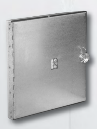
Models 08SCL & 08SH