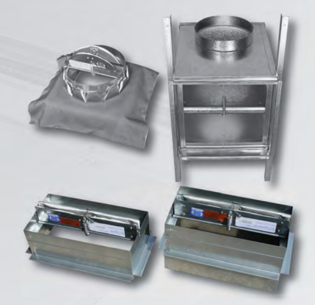
Models 0755, 0756, 0757 & 0757D (L to R)